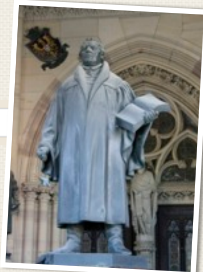
Martin Luther Statue, Speyer

SWITZERLAND PLAYED AN IMPORTANT PART IN THE REFORMATION. THE ZWINGLIANS AND ANABAPTISTS FOUND THEIR ROOTS IN ZURICH.