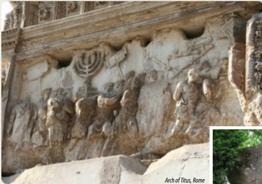
Arch of Titus, Rome

RETRACE THE ADVENTIST HERITAGE IN EUROPE FROM ITS ROOTS IN EARLY CHRISTIANITY, THROUGH THE DARK AGES, TO THE REFORMATION