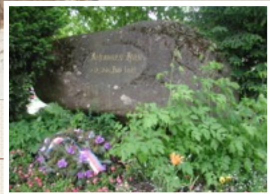
Place of Huss' Death, Konstanz

RETRACE THE ADVENTIST HERITAGE IN EUROPE FROM ITS ROOTS IN EARLY CHRISTIANITY, THROUGH THE DARK AGES, TO THE REFORMATION