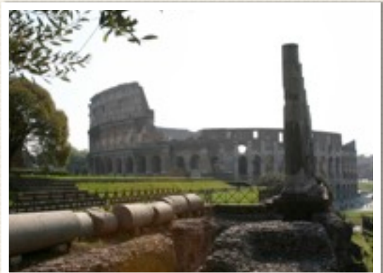
The Colosseum, Rome