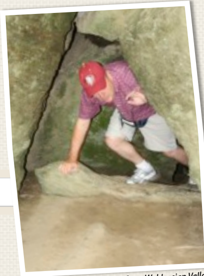
Entrance to Cave, Waldensian Valleys

“Wow! This was an amazing tour. I am surprised that more families with teens don’t do it. Perhaps they do and I just don’t know...but it really taught me about how our church began and also about what we, as the final generation will face. When we climbed the Casteluzzo it made me think about what I would have done. Would I have recanted, or kept my stand? Thank you so much for providing this tour! May God bless us as we near the end, and let us remain faithful.” (15 year old, from California)