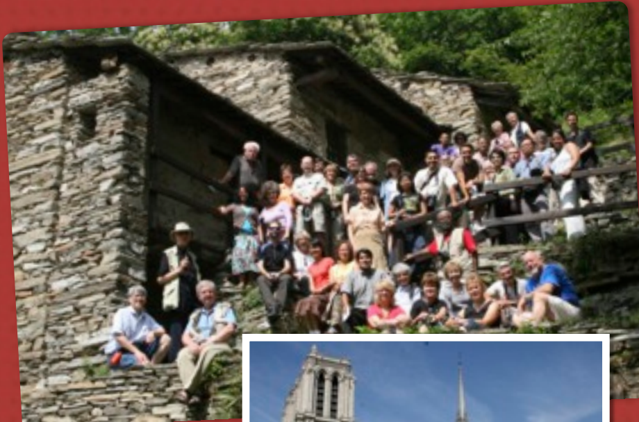
A GC Tour Group at the School of the Barbs

THE GREAT CONTROVERSY COMES ALIVE WHEN I REALIZE WHAT PEOPLE HAVE SUFFERED FOR US.