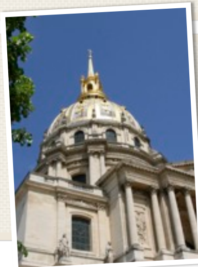
Tomb of Napoleon, Paris

MARTIN LUTHER’S REFORMATION SPREAD EVERYWHERE WITH THE NEW PRINTING PRESSES. WORMS WAS WHERE LUTHER MADE HIS STAND ON THE WORD OF GOD.