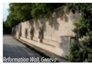
Reformation Wall, Geneva