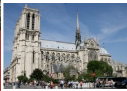
Notre Dame, Paris

THE GREAT CONTROVERSY COMES ALIVE WHEN I REALIZE WHAT PEOPLE HAVE SUFFERED FOR US.